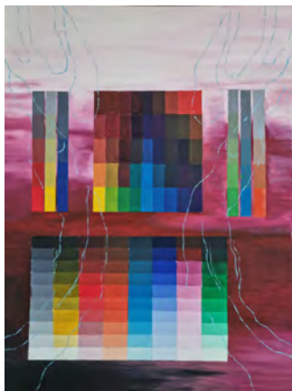
"The Tree of Colors" Year of creation 2015 Oil on canvas 32x24in $5,000