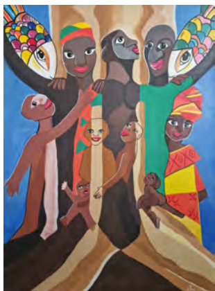
"The Tree of Africa" Year of creation 2018 Natural pigments and oleo on canvas 29x39in $8,600